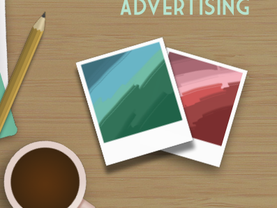
ILLUSTRATION INTERACTIVE DESIGN ADVERTISING

A high school diploma or GED is mandatory. Recommended Degrees include: GRAPHIC DESIGN